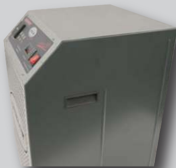
Handle scales on both sides