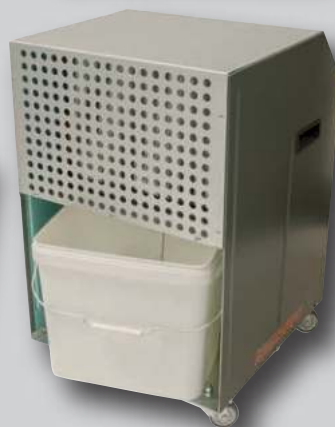
– Direct water drain – Water tank Option: Condensate pump