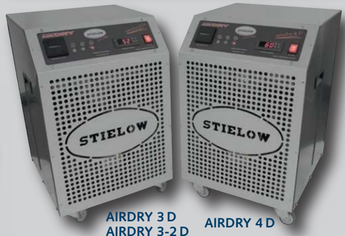
AIR DRY 3 D AIR DRY 3-2 D