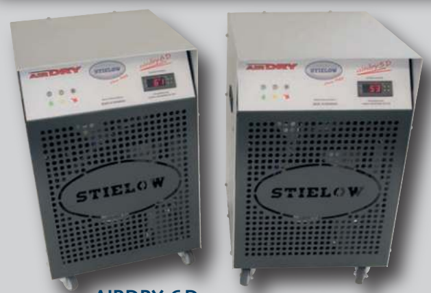
AIRDRY 6 D pro AIRDRY 6 plus D pro AIRDRY 5 D pro