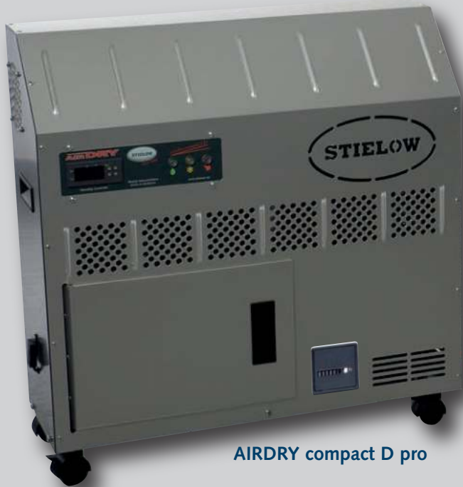
AIRDRY compact D pro