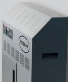
Handle scales on both sides