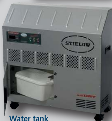
Water tank Option: Condensate pump