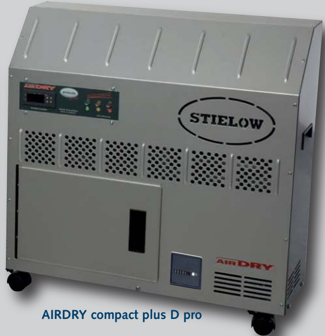
AIRDRY compact plus D pro