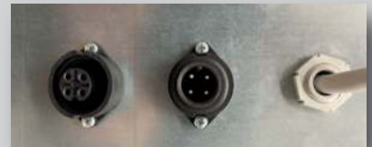
Potential-free fault indicator