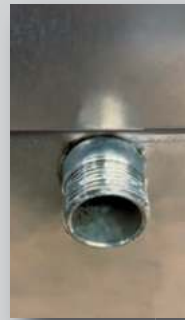
Water drain nozzle