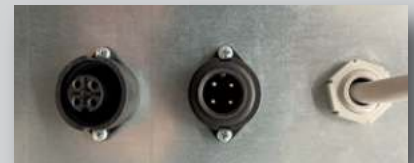
Potential-free fault indicator