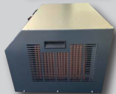
Device side view, air inlet side with handle scale