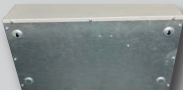
Rear panel with wall mounting points