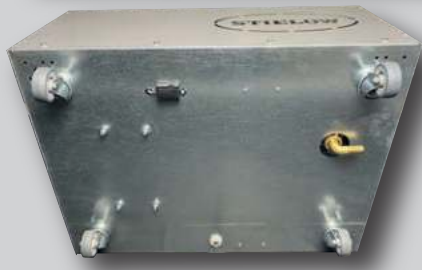
Underside of appliance with hose connection, removable castors